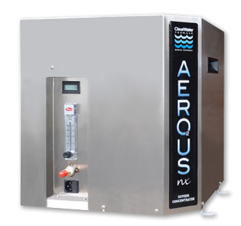
AEROUS NX15 Oxygen Concentrator