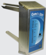
ComAir 20T Air Purification