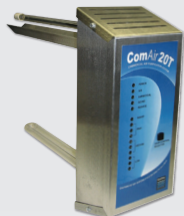
ComAir 20T Air Purification