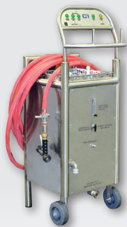
CI Mobile Disinfection Cart