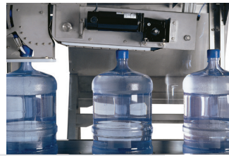
BOTTLED WATER FILL LINES