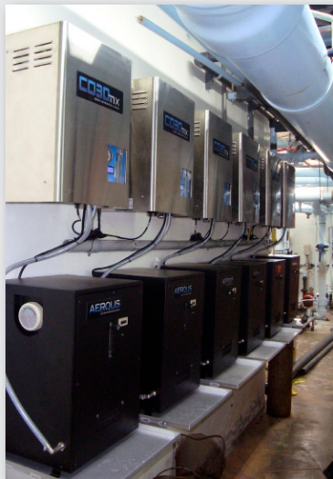
CD30nx Ozone Generators