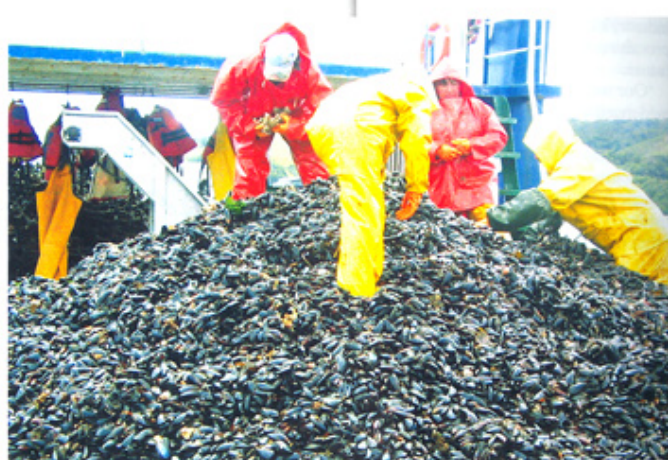
A mountain of mussels arriving at Pesquera El Golfo's recently commissioned processing plant at Chonchi, close to Castro, Chiloé Island's capital city

The impressive building has five 30,000 litre stainless steel tanks which hold a 150,000 litre supply of vegetable oil for its canned mussels in oil.