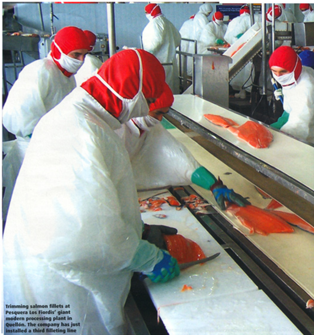
Trimming salmon fillets at Pesquera Los Fiordos' giant modern processing plant in Quellón. The company has just installed a third filleting line

'Los Fiordos has just commissioned a state-of-the-art hatchery up in the Andes mountains in Region IX, and in