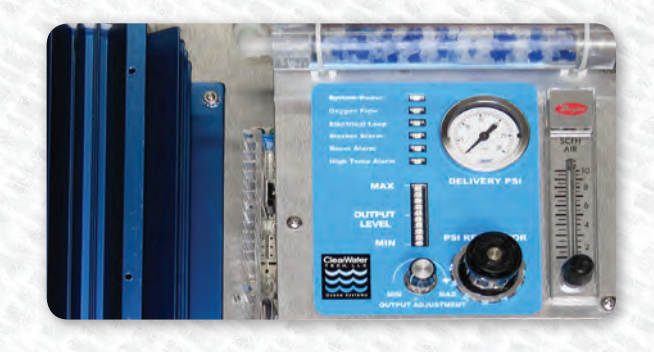
As opposed to a competitive venturi injection system (left photo), EcoTex diffusion systems (right photo) are meticulously engineered, third party tested and certified by UL, cUL and CE while being RoHS compliant and EPA registered. They're built for precise calibration and guaranteed, long-lasting performance.