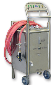
C1 Mobile Disinfection Cart